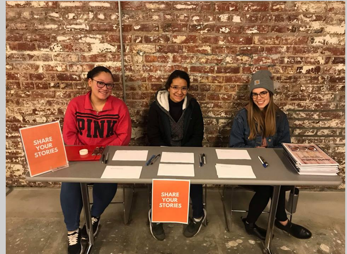
Undergraduate Social Work Service Learning Students tabling at Together Food Pantry collecting community stories for their blog.